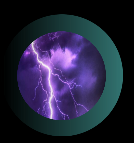
Spiritual In the Atmosphere

mental or emotional space controlled by our spiritual enemy.